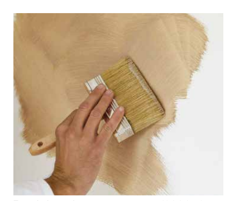
To apply the coating – use a 3 x 12 cm natural-bristle brush

On larger surfaces, it is recommended that the application and smoothening phases be done by two painters to ensure a uniform coat on the entire surface. One coat is required for light shades, whereas for dark shades we recommend two coats in order to achieve a better result. The drying time between each application should be at least 4 hours.