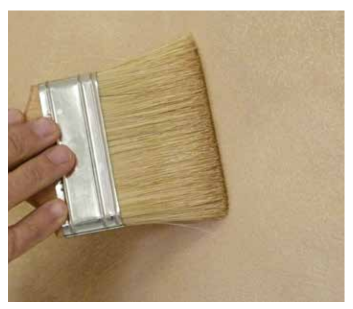
To smoothen the coating – use a 1,5 x 10 cm natural-bristle brush